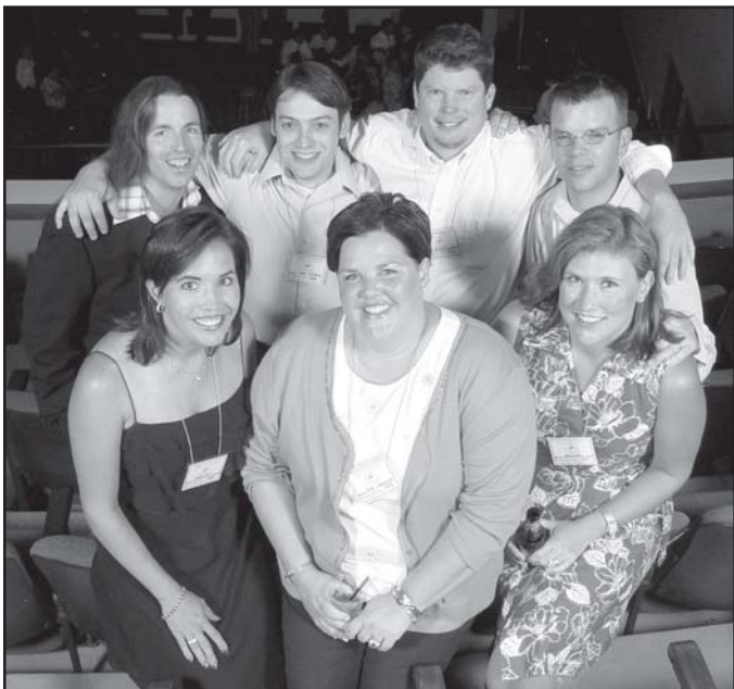
Class of 1986