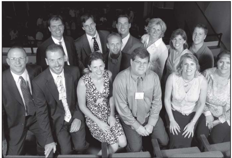
Class of 1984 at the State Theater

The final event of the weekend was the GM Alumni Family Picnic held at Cherry Hill Park behind the Community Center on Sunday afternoon. This is always a great wrap up event where all family members are encouraged to attend and can relax in an informal and kid friendly environment. Many GM Alumni stepped up to the plate and answered my call for GM alumni musical talent to come forward and play for us. They all did an excellent job of providing high quality entertainment to their fellow GM alumni, current and former faculty members, parents and friends. We will need that same GM Alumni talent and that of others in less than five years so keep playing and practicing! Vendors provided food and drink and the weather was perfect! I don't have a good e-mail database for our class; so when you get the chance, please send me an e-mail at: tomclinton1@aol.com. Always Mustang Review