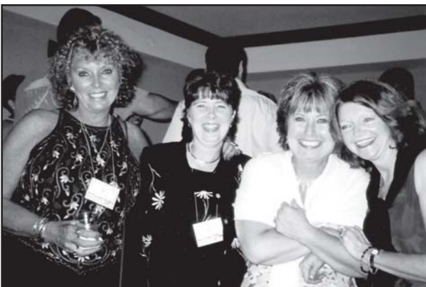
Class of 1968 Winter 2005

Finally, our next reunion will be June 2007. We are serious about this and we need your help. Please keep us up to date on your addresses, emails, and information