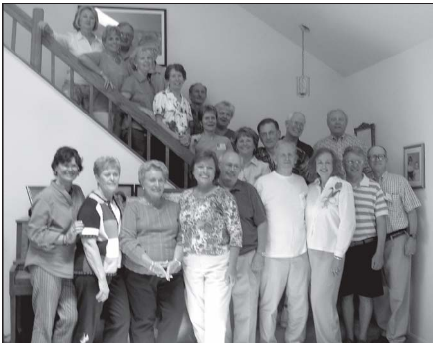
Class of 1959

Well, we started about a year ago with a committee of 11 to make plans for our 41st class reunion. My first thoughts were that the commit-