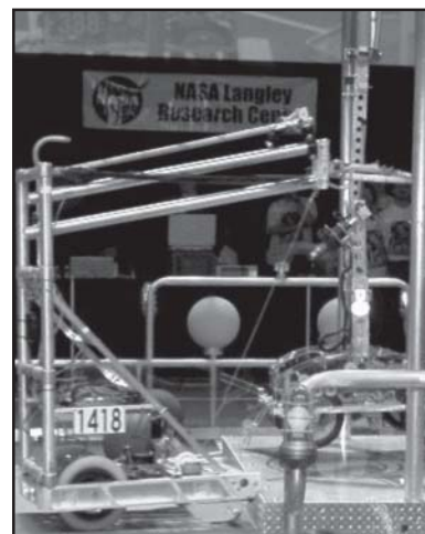
GMHS's award-winning entry in last year's Robotics Competition.