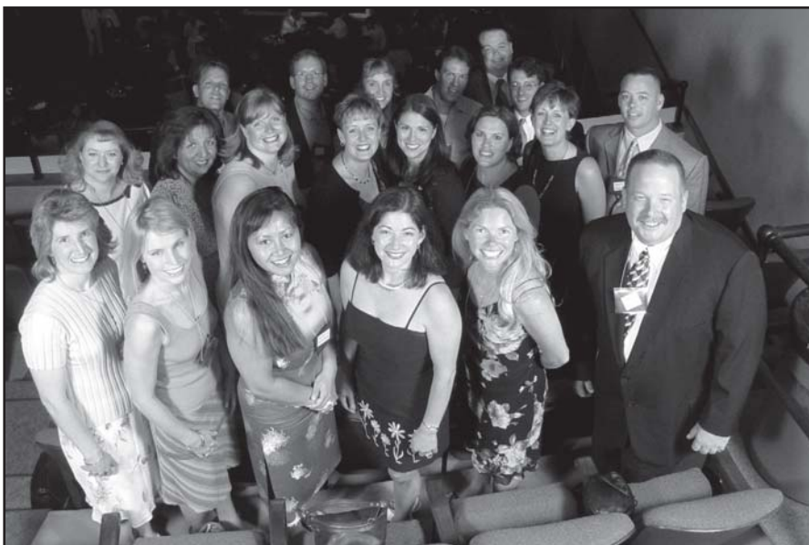
Class of 1985