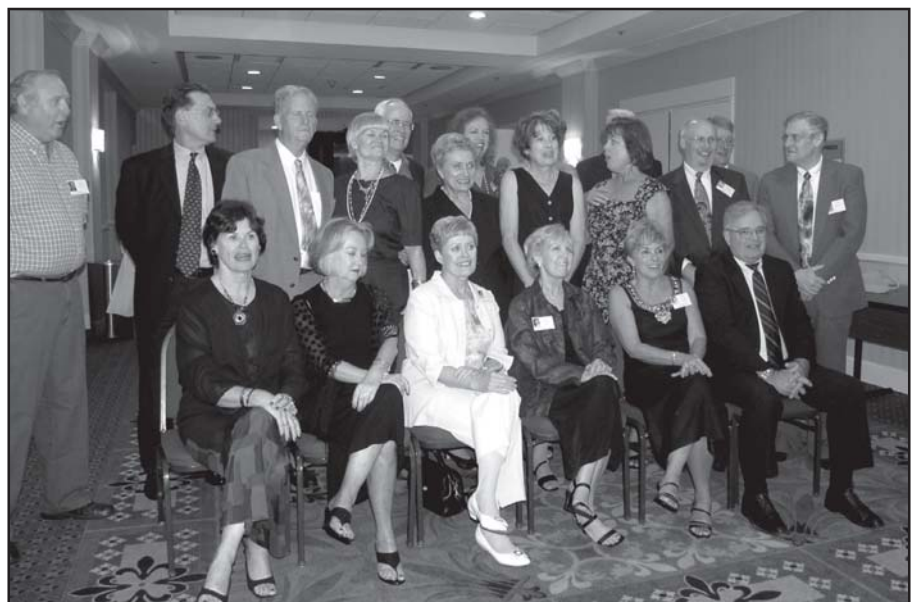
Class of 1959