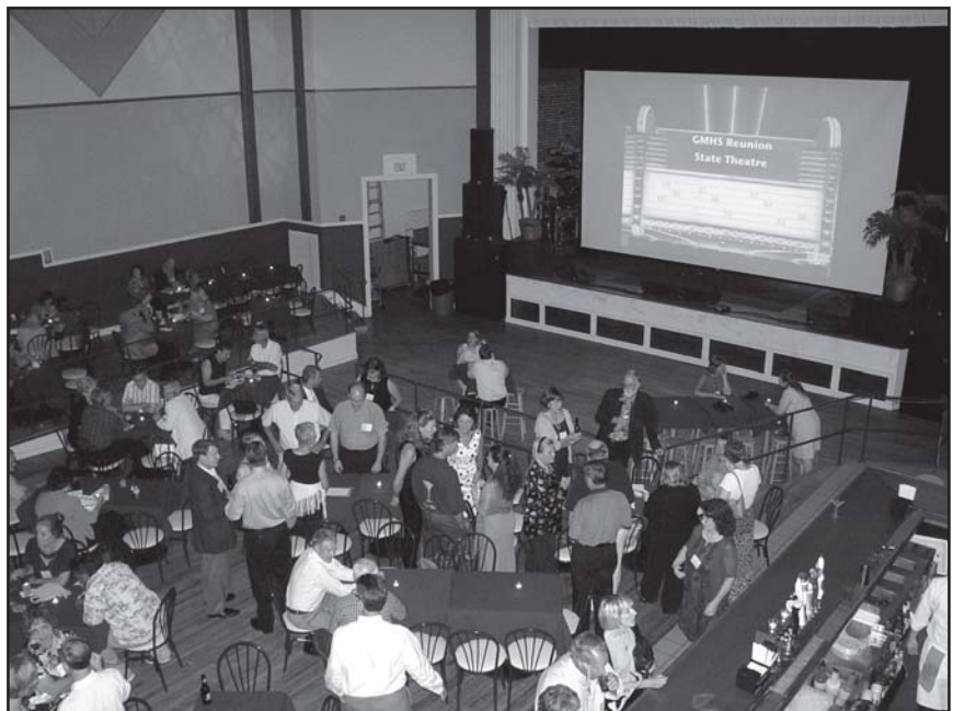
At The State Theater