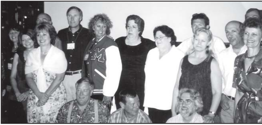
Class of 1968