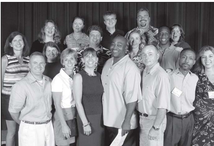
Class of 1979