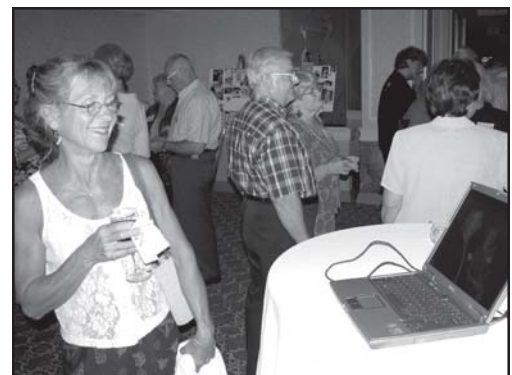
Class of 1963