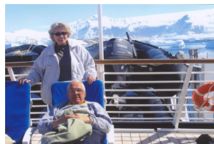
View full size

Antarctica we were rewarded with gorgeous weather and an adventure of a life time. For some reason I thought everything would be flat. I was not prepared for the HUGE, black granite, mountain ranges....nor the stark solitude and blessed silence. I was surprised by the large areas with no snow or ice...hummm. As slow as penguins are on land they swim like lightning! They have no fear of humans. Wading ashore and the Zodiac boats (background of picture) were my biggest challenge. By the end of the trip I could get in and out without making a fool of myself. We have many, many stories (would you believe two hotels fires and evacuations, 1,000 miles apart, on the SAME day!??) and have hundreds of photographs. Come see us! This one was taken in Paradise Bay, Antarctica.....gorgeous.